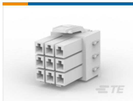
TE Part # 177903-1 POWER DBL LOCK PLUG HSG 9P