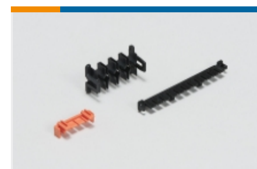
Rectangular Connector Locking(14)