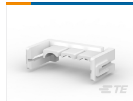
TE Part # 177919-1 POWER DBL LOCK PLATE 3P